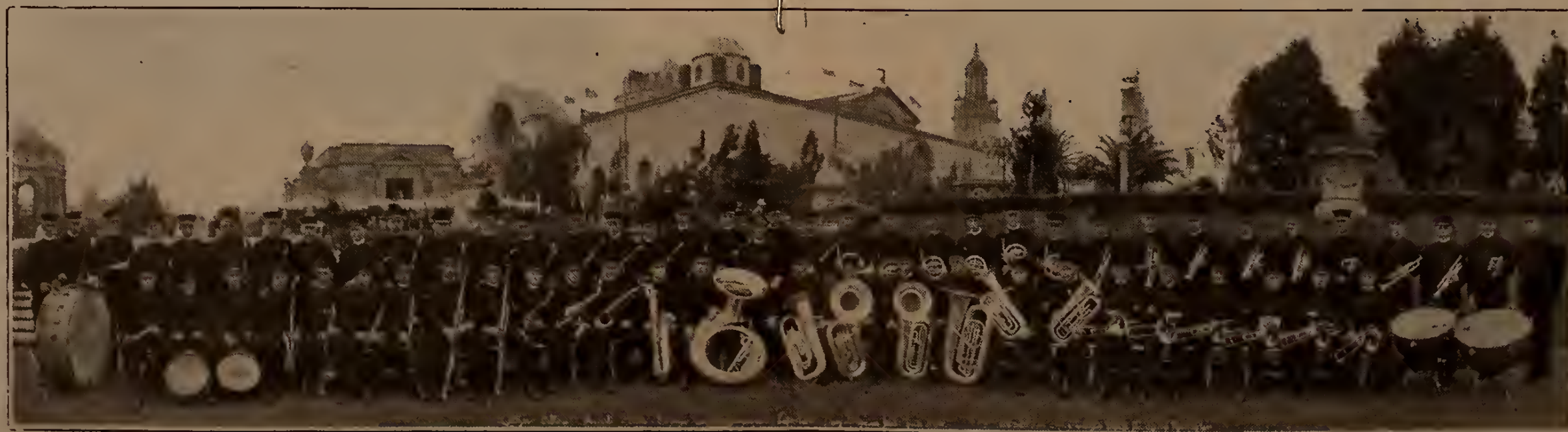
The Concert Band at the Panama-Pacific Exposition

The next year the band was invited by the management of the Panama-Pacific Exposition to play during the fair at San Francisco. In spite of the long trip of the year before, a contract was made and the engagement filled. The band went out by way of Salt Lake City and returned by a northern route after playing in Los Angeles, Santa Barbara, and the Puget Sound cities.